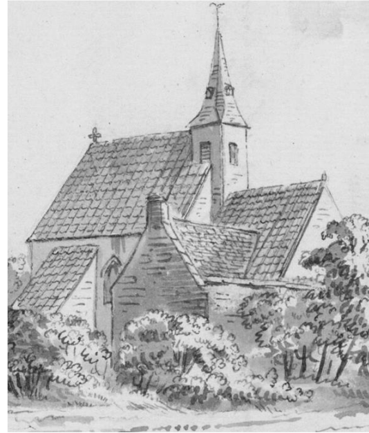
original Bothwell Church