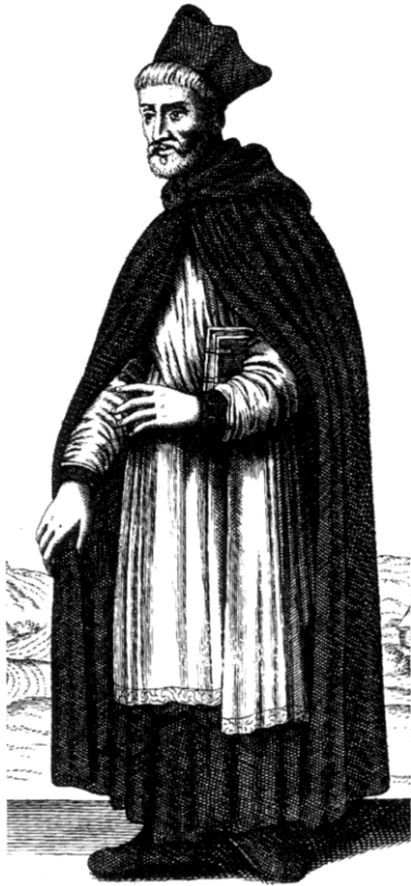
an Augustinian Prior

part of the 450th anniversary celebrations of Blantyre Old Parish Church.